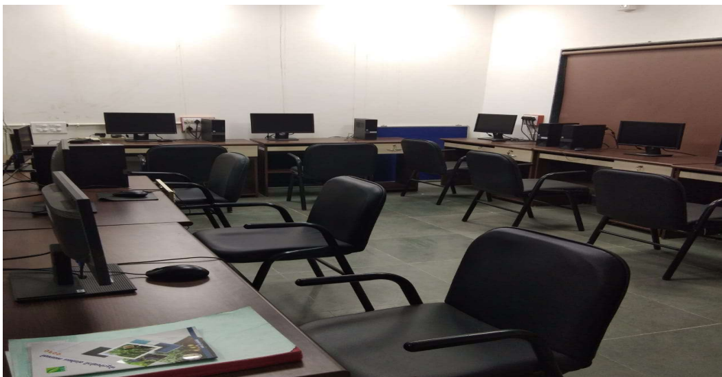
(Computer Lab with internet to access E-resources)

The Library has a LAN setup and internet with 11 computer terminals. Recently the Library has taken necessary steps to transform the library into a fully automated one with the installation of KOHA software developed exclusively for libraries. Bibliographic database of library collection is completed and now available through OPAC of the Library. University Library is being done all its work through library management software. CCTV is another addition of the Library as security system which helps in security of library resources as well as library management.