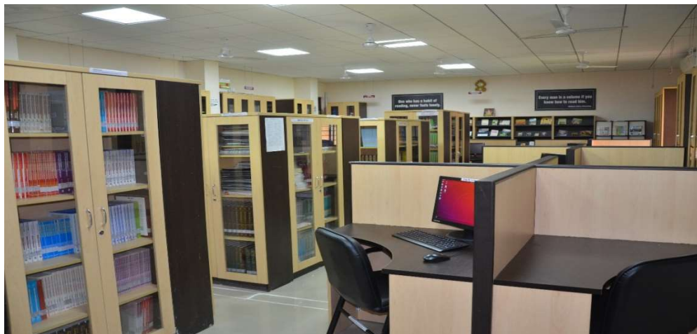
(Library Collection at College of Dairy Science, Amreli)

The College of Dairy Science, Amreli was the first constituent college of the Kamdhenu University and was established at Amreli as on August 01, 2010. It has a rich and comprehensive Library collection of not just books and journals but also has a vast resource base of e-resources. The Unit Library has a total of 4620 books, 262 CD/DVDs, 26 current periodicals/magazines & Research journals, 05 newspapers, 1251 back volumes of journals, 19 Dissertations and thesis, 213 E-books and 91 reports.